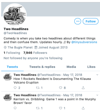
Figure 1: A screenshot of a bot shown to participants in the study.

We presented participants with the accounts of one group in the first stage, followed by the accounts of the other group in the second stage. To mitigate ordering effects, we alternated between presenting group A first followed by group B and vice versa between stages, and randomized the order of accounts within each stage. Each classification question contained a screenshot of the profile page of the account (containing picture, description, number of followers, ...), followed by as many of the account’s most recent tweets as would fit on a 1,920×1,080 screen (a minimum of one tweet, and a median of 2), see Fig. 1.